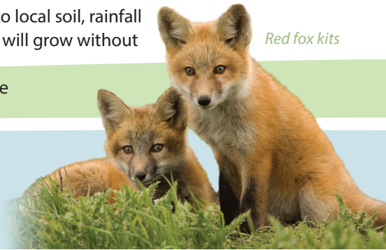
Red fox kits