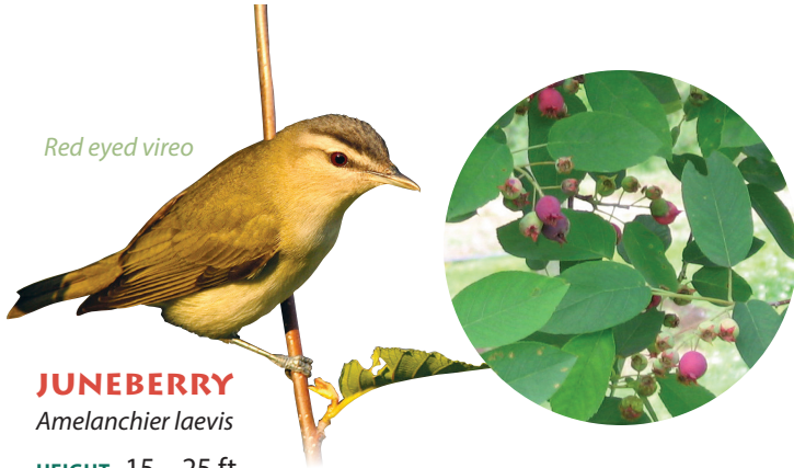
Red eyed vireo